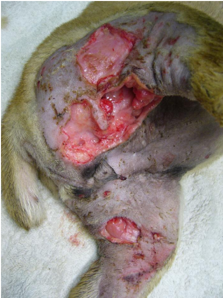
Wounds after debridement