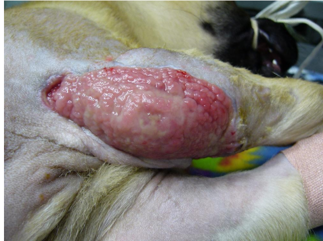
8 Light therapy sessions and 12 days later, good granulation tissue formation