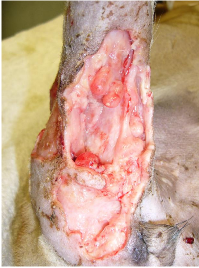
Wounds after debridement