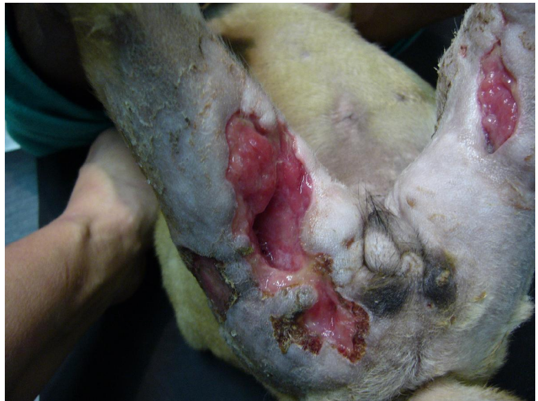
7 Light therapy sessions and 10 days later