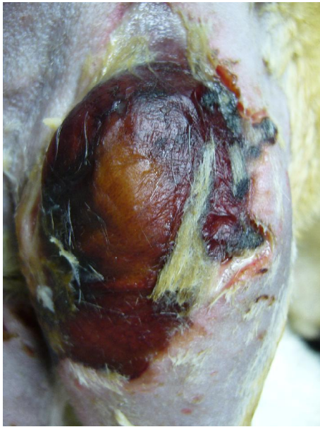
Presenting right elbow Severe necrosis of skin