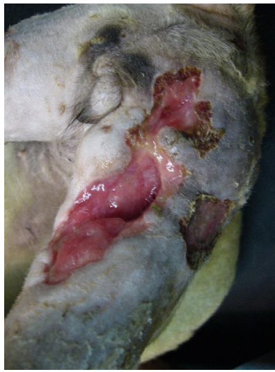
7 Light therapy sessions and 10 days later