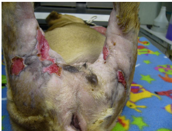
8 Light therapy sessions and 12 days later Good contraction of the wounds, no surgery was needed