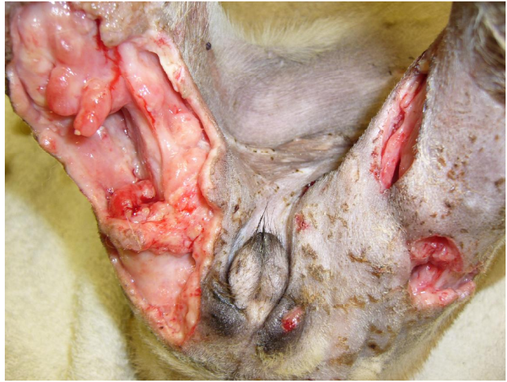
Wounds on hind limbs after surgical debridement