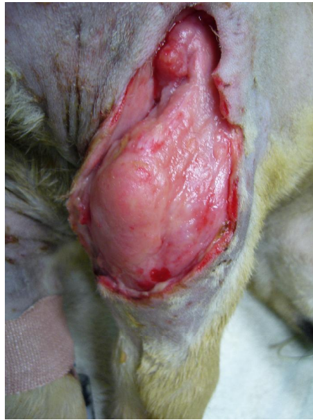
Elbow after surgical debridement Light therapy started thereafter