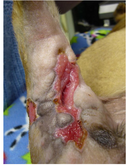
8 Light therapy sessions and 12 days later

Good contraction of the wounds, no surgery was needed