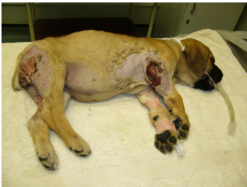
Presenting patient, 3 days after being attacked by a Maltese