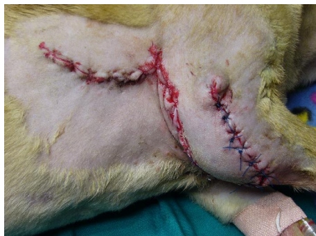
Skin flap: 13 days after the start of light therapy